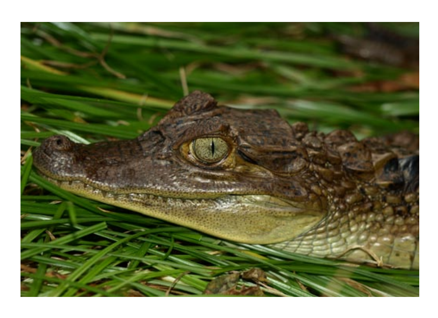
IUCN • Species Survival Commission

VOLUME 30 No. 3 • JULY 2011 - SEPTEMBER 2011