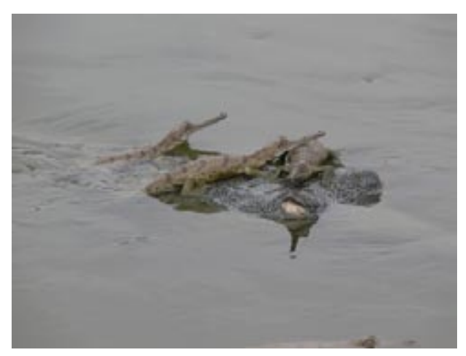
Figure 1. Hatchling Gharials resting on adult female.

On 2 June 2011, a Society for Conservation of Nature volunteer (Munendra) observed a female Gharial carrying hatchlings in her mouth and releasing them into the water. She repeated this several times, by which time around 46 hatchlings had been transported to the water. The female remained at the site, guarding the hatchlings (Fig. 1), as has been observed in other crocodilians.