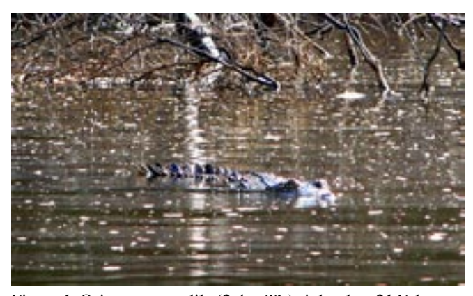
Figure 1. Orinoco crocodile (2.4 m TL) sighted on 21 February 2011.

It continued, with its head at the water surface, expelling air through its mouth to create bubbles and finally returned to its original position with the dorsal part of its head out of the water before diving once again. This behavior is similar, with some differences, to that described by Medem (1981), Thorbjarnarson and Hernández (1993), Colvée (1999) and Antelo (2008) for captive C. intermedius in Colombia and Venezuela. This is the first territorial behavior pattern described for the species in the wild in Colombia.